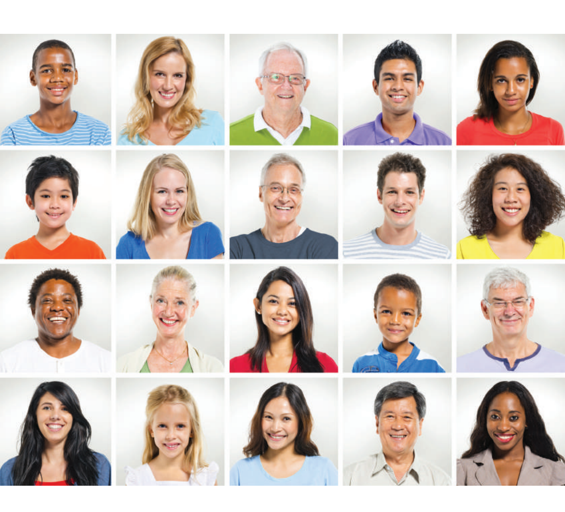
Bone Grafting & Guided Bone Regeneration A Patient's Guide