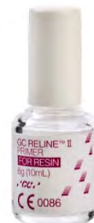
GC RELINE II Primer for resin

You can add material within 3 months after the first application, to adapt to changes of the mucosa and bone. The new GC RELINE II Remover for resin makes it possible to remove the relining layer and replace it very quickly.