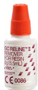
GC RELINE II Remover for resin